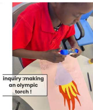
e to: Olympic Last Event The Marathon. Racing Caterpillars! Inquiry Unit